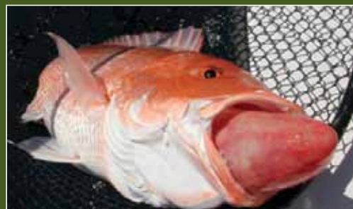
Pictured above: A red snapper suffering from barotrauma. The swim bladder has ruptured and expanding gas has caused the stomach to evert. The chance of survival for this fish increases if quickly vented and/or returned to at least half of capture depth.