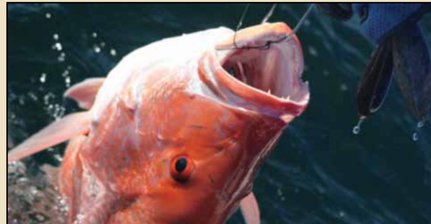
Pictured above: A red snapper about to be recompressed by use of a release weight. Note the barbless hook and two lead weights which aid the buoyant fish in returning to half of capture depth.

The Louisiana Department of Wildlife and Fisheries promotes the conservation of our resources; the Department encourages all fishing practices that include responsible catch and release techniques.