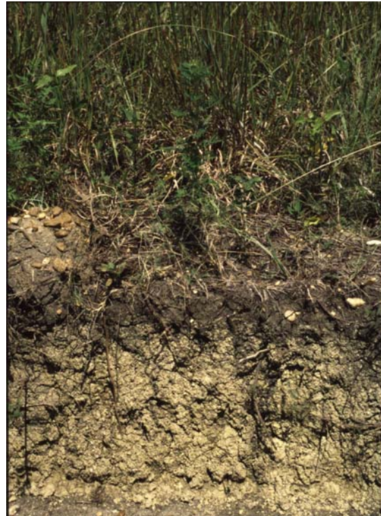
Soil profile with exposed calcareous nodules