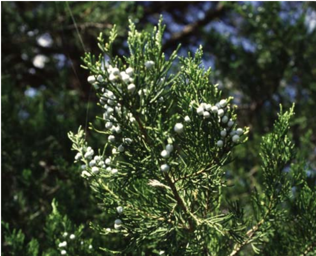
Eastern red cedar in fruit