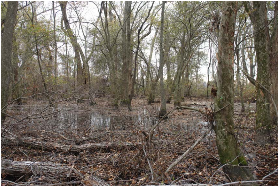
Interior view of Macon Ridge green ash pond surrounded by agricultural fields.