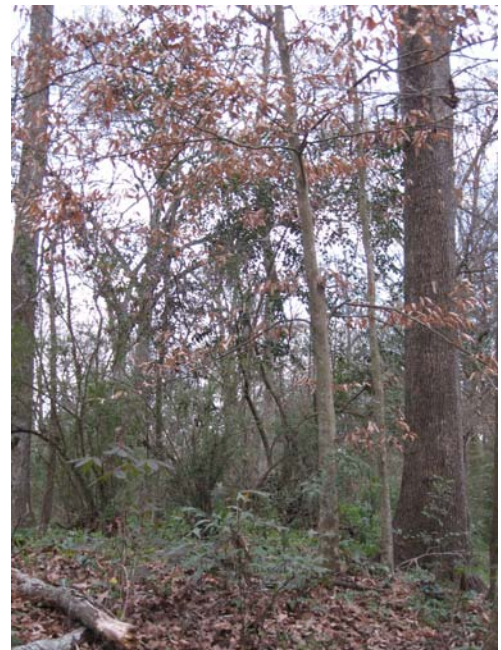
Photos left to right: Trillium foetidissimum , Spigelia marilandica , and winter view of Prairie Terrace Loess Forest