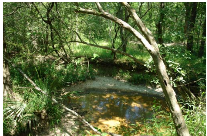
Small pond depression within saline oak woodland