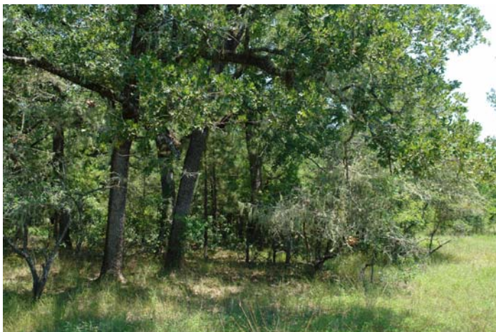
Woodland to prairie interface with scrubby hawthorns along woodland edge