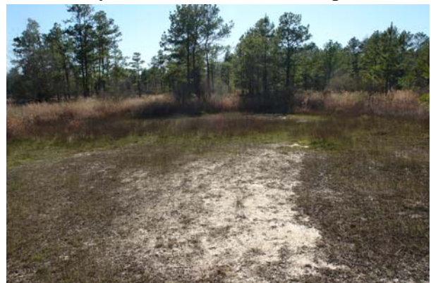
Saline prairie salt slick