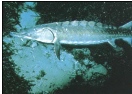
U. S. Fish & Wildlife Service