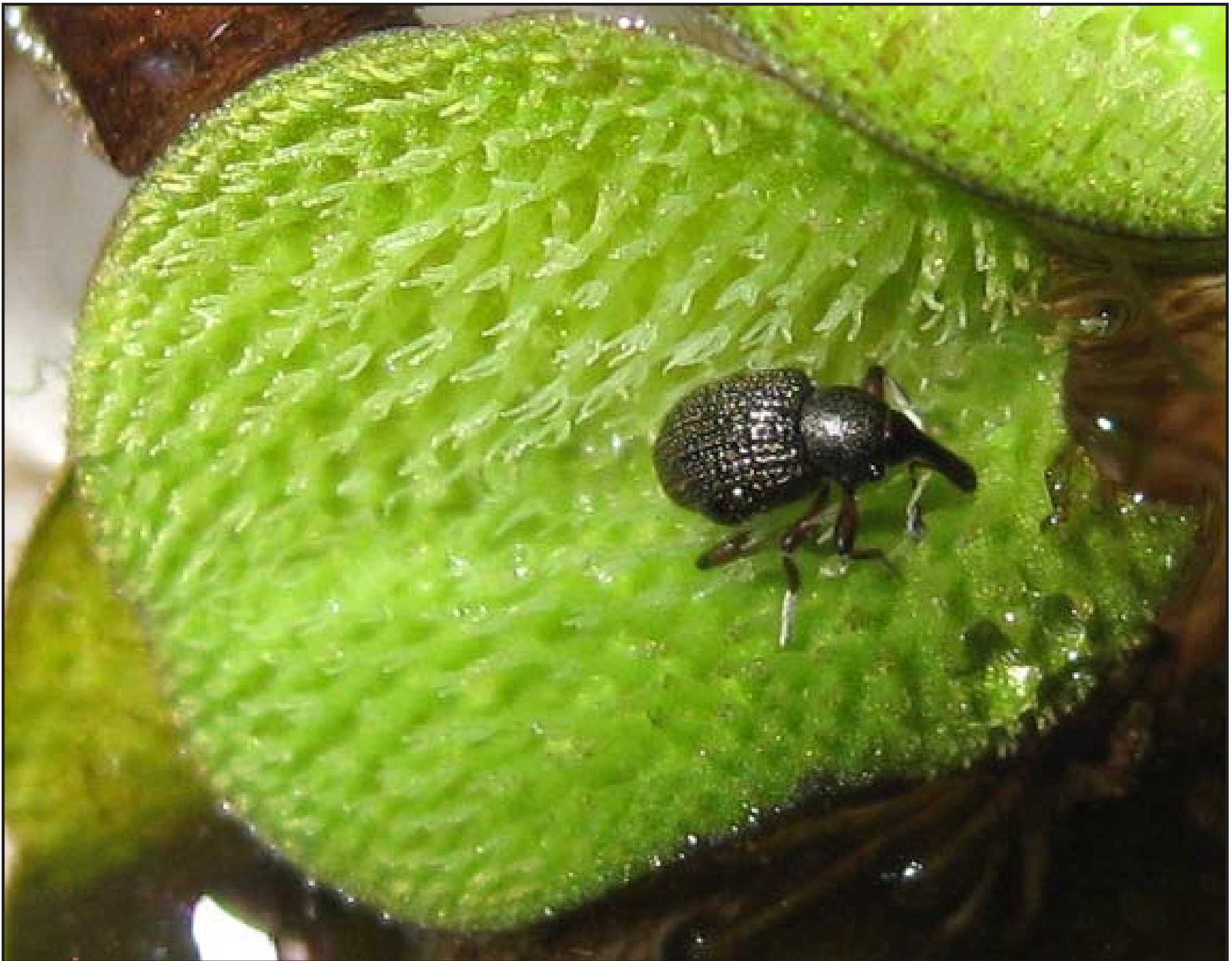
The Department is currently distributing a Florida strain of weevils throughout the state as a bio-control management tool to fight against aquatic invasive weeds.