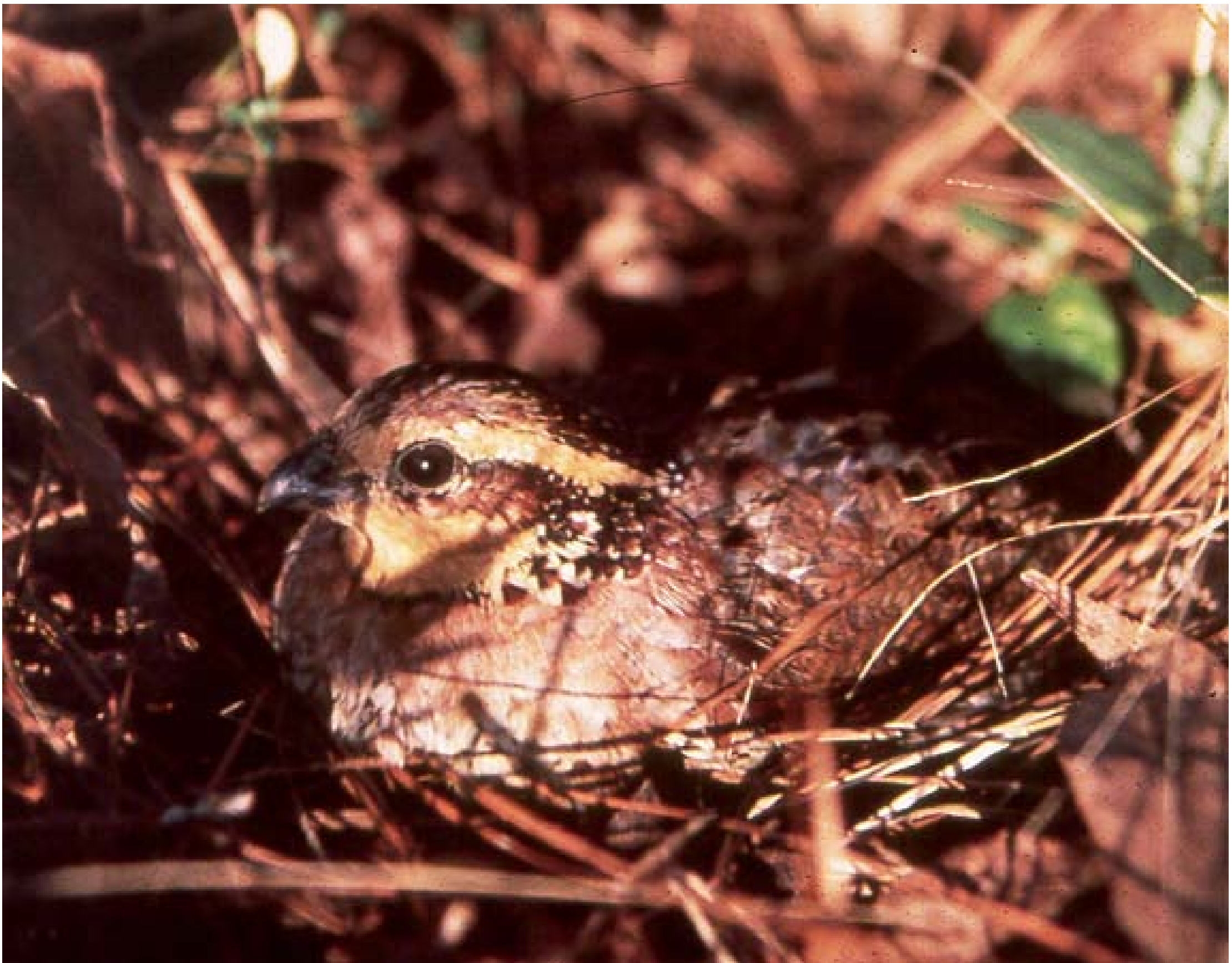
There has been an 85 percent decline in the Louisiana quail population since 1966. In response, the Department has formed the Louisiana Quail and Grassland Bird Task Force to help create and implement a quail restoration plan.