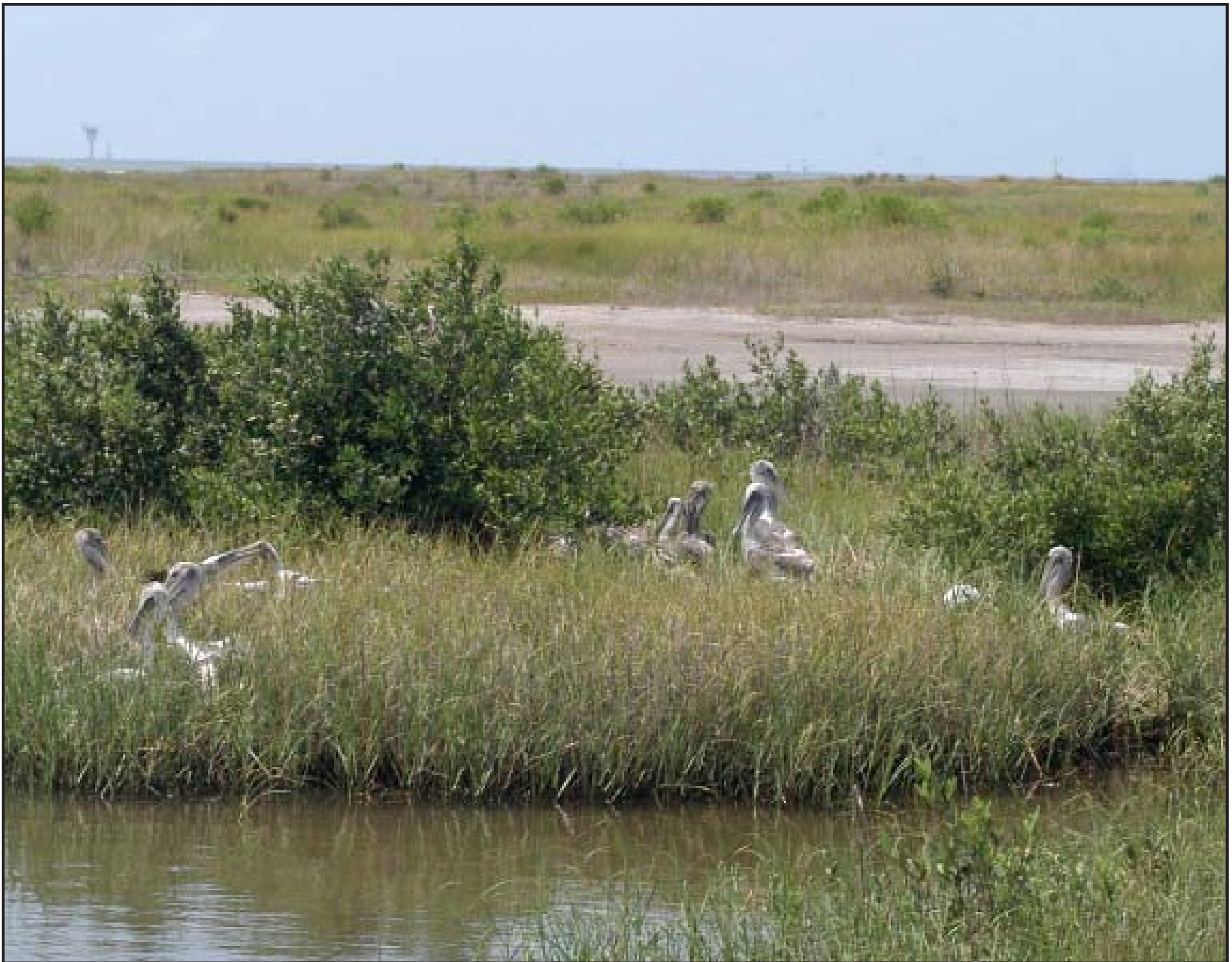
Successful conservation efforts for the brown pelican by LDWF resulted in its removal from Louisiana's endangered species list in 2008.