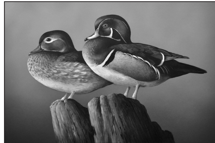
2011 Louisiana Duck Stamp by Wes Dewey The print depicts a pair of wood ducks perched on a weathered stump.