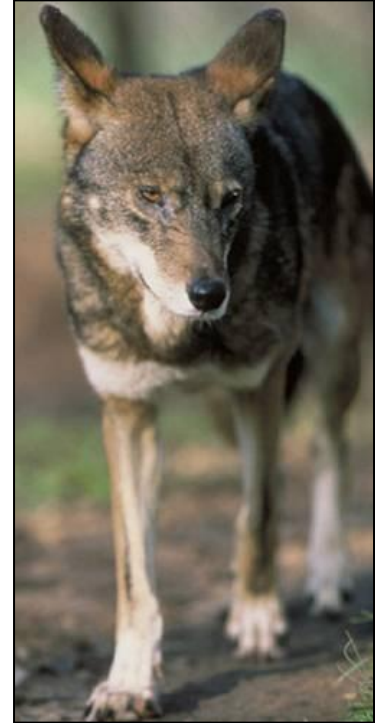
U.S Fish and Wildlife Service