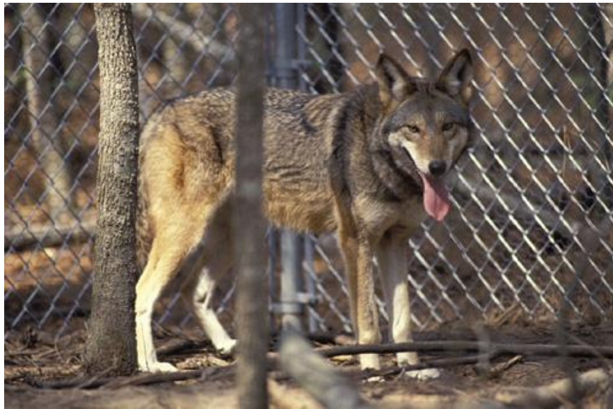
U. S. Fish and Wildlife Service