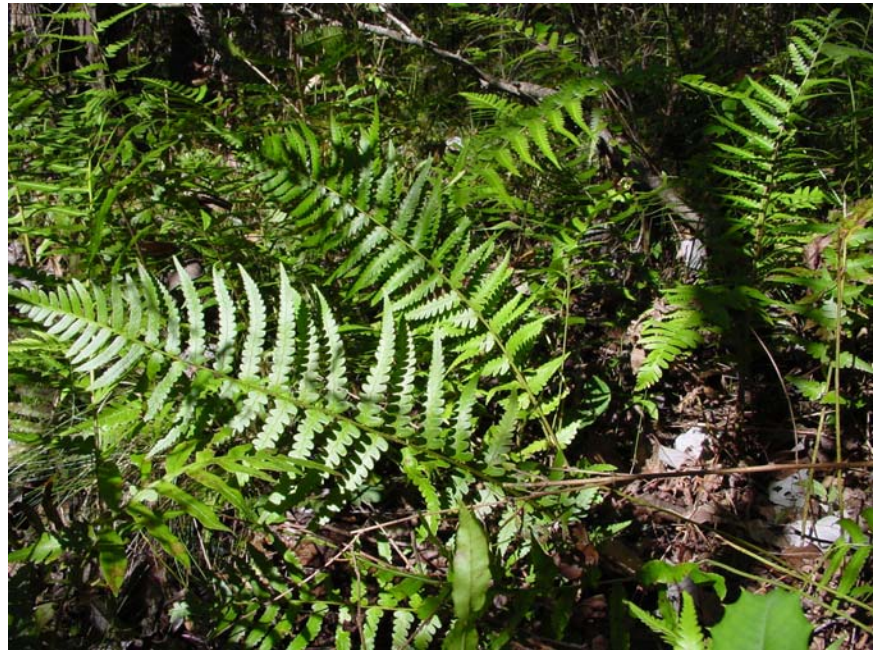
Dryopteris ludoviciana growing in a forested seep in Bienville Parish.