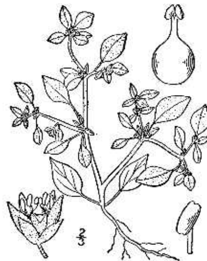
USDA-NRCS PLANTS Database / Britton, N.L., and A. Brown. 1913. Illustrated flora of the northern states and Canada . Vol. 2: 7.

Flowering Time: Throughout the growing season