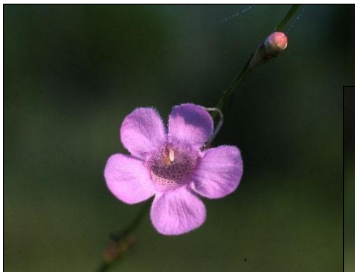
Above: Front view of Agalinis linifolia