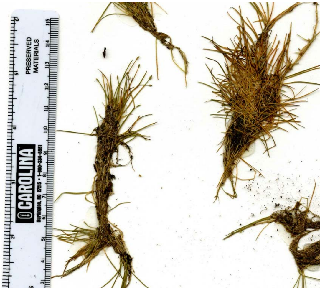
Herbarium specimen of Eleocharis radicans .