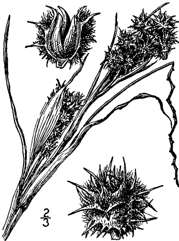
Britton, N.L., and A. Brown. 1913. An illustrated flora of the northern United States, Canada and the British Possessions . Vol. 1: 167.