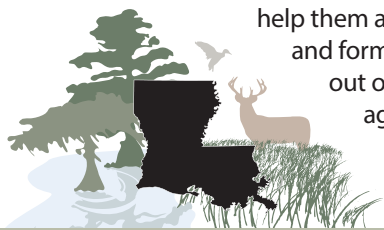
LDWF Private Lands Program

Over 90% of Louisiana is privately owned and LDWF recognizes private landowners as a group that must be engaged to improve habitat on a statewide scale. LDWF biologists are available to assist Louisiana landowners with habitat management practices that will help them achieve their wildlife management goals. Staff are trained to take into account a landowner's objectives and formulate and help carry out a plan of action tailored for each landowner. Additionally, biologists will point out other potential projects and funding sources, as well as opportunities offered by other government agencies, non-governmental organizations and private resource professionals. There are many resources available to help the private landowner deliver the conservation that is necessary to benefit the natural communities that we all value. For more information, visit our website or contact your regional office : Minden 318.371.3050; Monroe 318.343.4044; Pineville 318.487.5885; Lake Charles 337.491.2575; Lafayette 337.262.2080; Hammond 985.543.4777; New Orleans 504.284.5269