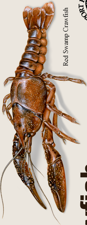
Red Swamp Crawfish