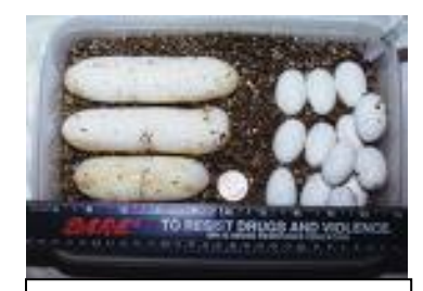
LA Pine Snake eggs (left) and black rat snake eggs (right)

In studies in east Texas and west Louisiana, pine snakes spent at least 59% of their