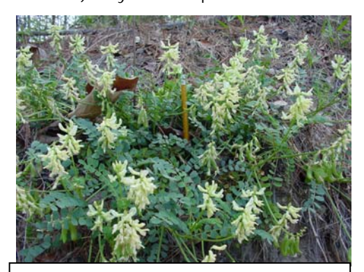
Astragalus soxmaniorum, Soxman's s milk-vetch

(especially those in genera Cladina and Cladonia ) may occur in profusion.