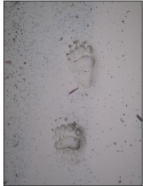
Black Bear tracks