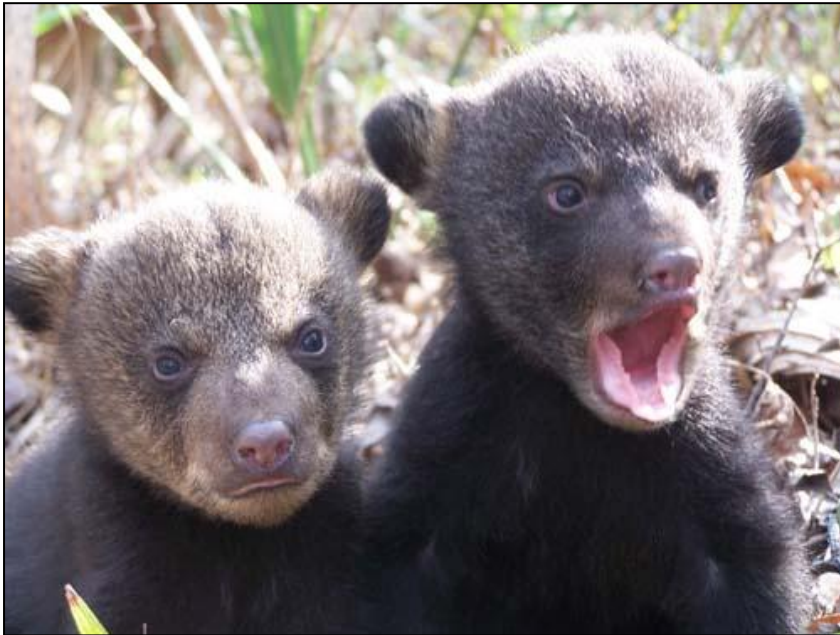
Black Bear Cubs

Terrebonne, Atchafalaya, Vermilion-Teche, Ouachita