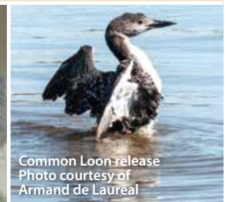
Common Loon release

For more information on the Wildlife Rehabilitator Program or to receive an application for a Wildlife Rehabilitation Permit, please refer to the contact information on the back of this pamphlet.